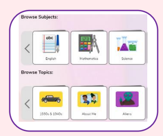
Subjects & Topics